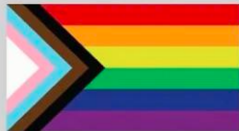
Progress Pride Flag

The city of Philadelphia added two lines—black and brown, to represent people of color in the queer community.