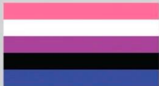
Genderfluid Pride Flag

This flag was designed by JJ Poole as a symbol for genderfluidity. A genderfluid person does not have a fixed gender identity. Pink represents femininity, white represents all genders, purple is a combination of masculinity and femininity, black represents lack of gender and blue represents masculinity.