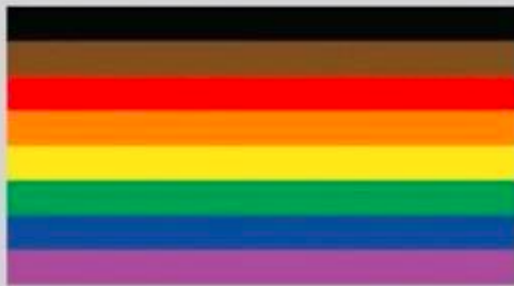
Philadelphia People of Color Inclusive Flag

The community landed on this six-color flag in 1979. The pink and turquoise colors were dropped because of the low demand in fabric. This flag is a world-wide symbol of the LGBTQ+ community.