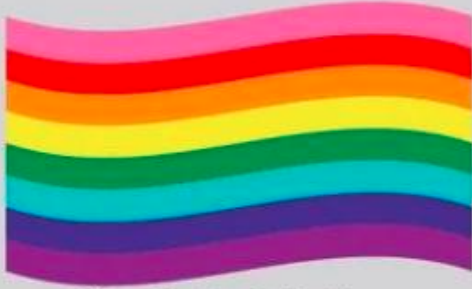
Gilbert Baker Pride Flag

Harvey Milk challenged Gilbert Baker to design a symbol of pride for the gay community. The flag flew at the San Francisco Gay Freedom Day Parade on June 25, 1978. Each color represents an aspect of queer PRIDE.