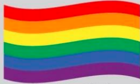
Traditional Gay Pride Flag

Harvey Milk challenged Gilbert Baker to design a symbol of pride for the gay community. The flag flew at the San Francisco Gay Freedom Day Parade on June 25, 1978. Each color represents an aspect of queer PRIDE.